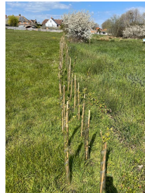
Previous Ouse & Adur Rivers Trust NFM projects include the creation of urban wetlands (left), installation of leaky dams (centre) and planting cross slope hedgerows (right).