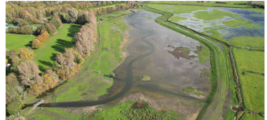
Large capital projects such as the Cockshut Restoration (Lewes Brooks) reduce peak flows to Lewes by 40 minutes, provide biodiversity benefits and create functional floodplains.